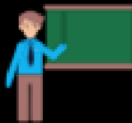
train the trainers